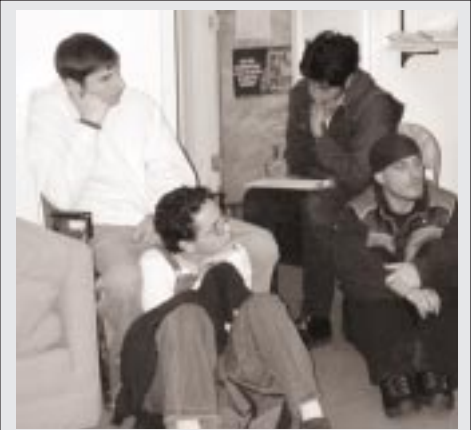
Community members discussing INS detention centers at PARC's March film and discussion night.

Thanks to your support, PARC has grown by leaps and bounds!