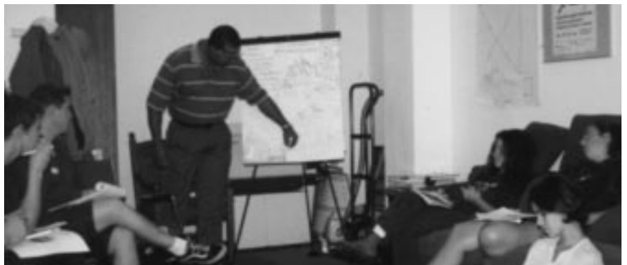
PARC members at a recent anti-racist training. One of our steps towards self education and building a stronger organizing community.

PARC has hosted informative and inspiring literature tables at numerous events in the SF Bay Area and other cities. This fall we will send out student organizing packets to college campuses across the country to support and